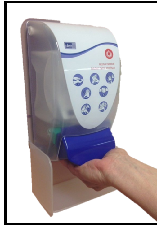
Perform hand hygiene after glove removal.