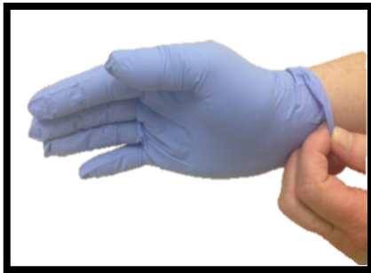
Don the first glove.