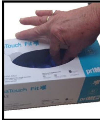
Take a glove out of its original box.