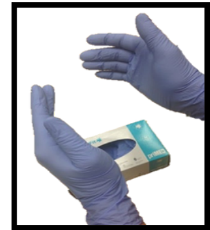
Avoid touching the skin of the forearm with the gloved hand. Once gloved, hands should not touch anything other than the direct task for glove use.