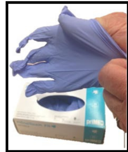
Touch only the top edge of the cuff.