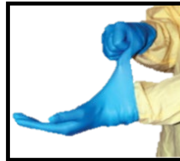
Gloves go over the cuff of the gown.