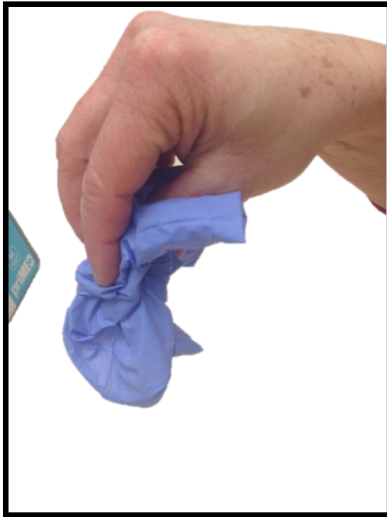
Discard the gloves.