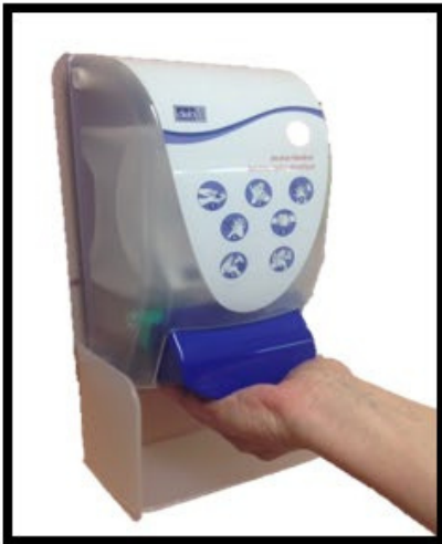
Perform hand hygiene.