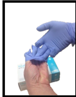
Take the 2nd glove with the bare hand and touch only the top edge of the cuff.