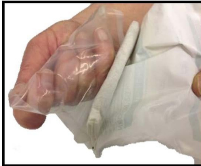
Open the inner glove packaging to expose 2 nd sterile wrapper.