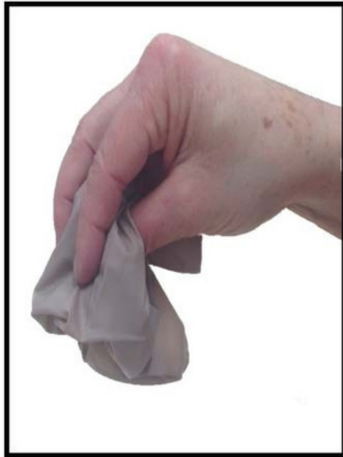
Discard the gloves.