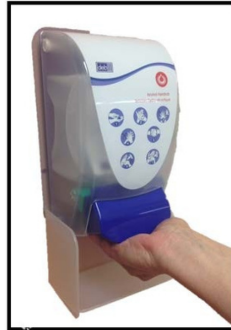
Perform hand hygiene after glove removal.