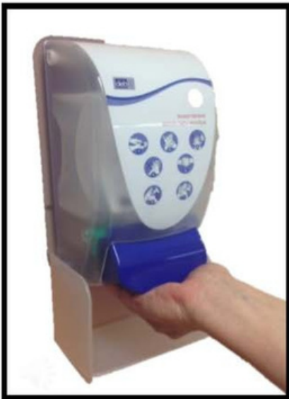
Perform hand hygiene.